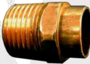
Copper x Male