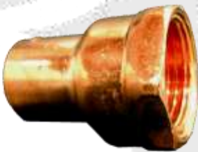
Copper x Female

Part #COPCsize Sizes: 3/8" - 6 and Reducing sizes