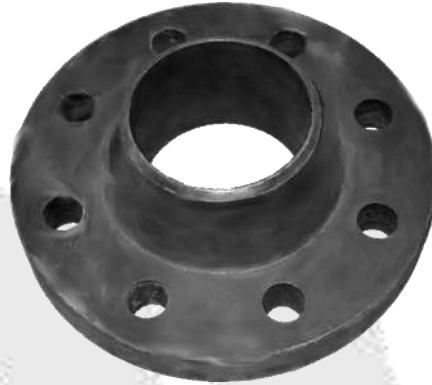
WELD NECK 1L1W (150lbs.) 1L3W (300lbs.)