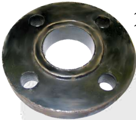
SLIP ON 1L1S (150lbs.) 1L3S (300lbs.)