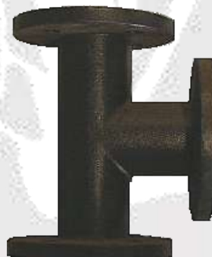
Flanged Reducing Tee