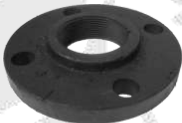
Cast Iron Threaded Companion Flanges #125