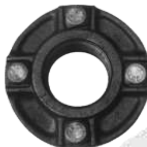
Flanged Union Threaded