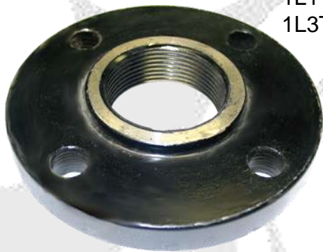
THREAD 1L1T (150lbs.) 1L3T (300lbs.)