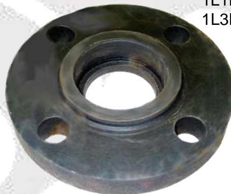
SOCKET WELD 1L1K (150lbs.) 1L3K (300lbs.)