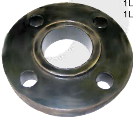
LAP JOINT 1L1L (150lbs.) 1L3L (300lbs.)