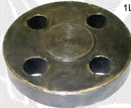
BLIND 1L1B (100lbs.) 1L3B (300lbs.)